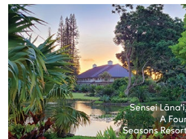
Sensei Lāna'i, A Four Seasons Resort

Hidden away from the world on the quiet Hawaiian island of Lāna'i amidst a towering forest of trees lies Sensei Lāna'i, A Four Seasons Resort. While there are certainly serene pools and access to white sand beaches available, the luxury getaway-meets-health retreat is designed to take relaxation beyond reclining chairs with amenities like one-on-one coaching and body mapping massages. Before arrival, each guest is paired with a wellness guide—a sort of personal guru for your stay—who will help craft a custom itinerary via a robust questionnaire. Looking to relax and unwind? Yoga, massages and meditation sessions can be added to the itinerary. Prefer a more active vacation? You can horseback ride, forest bathe, snorkel, hit a round of golf or sail into the sunset. It's a build-your-own-adventure of relaxation, a rare retreat that offers sublime quality on all fronts, from wellness to dining overseen by chef Nobu Matsuhisa. fourseasons.com