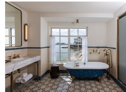
A guest room bathroom

The former Club Union of Panama in the historic center of Casco Viejo, a designated UNESCO World Heritage Site, is now home to the first Sofitel Legend property in North and Central America. The sixth property in the French luxury brand's portfolio, Sofitel Legend Casco Viejo is perched at the edge of the Pacific Ocean and has been thoughtfully reimagined to preserve the building's rich history while adding state-of-the-art amenities including a sprawling spa and fitness center, two restaurants, a rooftop bar with sweeping views of Panama City and a refreshing oceanfront pool. With the original colonial architecture preserved, Sofitel has woven contemporary design touches into each of the 159 rooms and suites, many with balconies that are perfect for sunset viewing. The culinary program is already taking center stage with award-winning Michelin star chef Lorenzo Di Gravio at the helm of Caleta, a Mediterranean-meets-Panama concept, and local cocktails on offer at the atmospheric Mayda Lobby Bar. For cultural exploration—activities include private tours of the Panama Canal and the storied Teatro Nacional, sunset cruises and rum tastings—as well as world-class surroundings that seamlessly fuse history with modernity, the Sofitel Legend Casco Viejo promises to be a true Central American highlight. sofitel-legend-panama.com