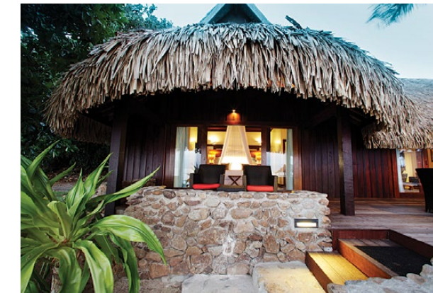
A luxury two-bedroom villa