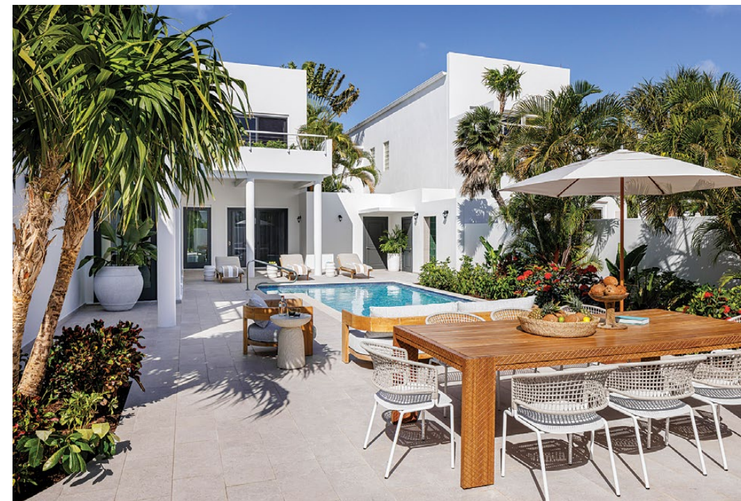
FROM TOP: A view of Rendezvous Bay from the balcony of a beachfront one-bedroom suite; a villa at Aurora Anguilla