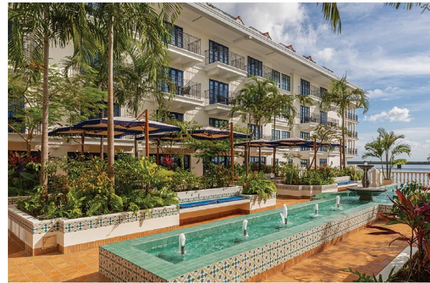
The exterior of the Sofitel Legend Casco Viejo